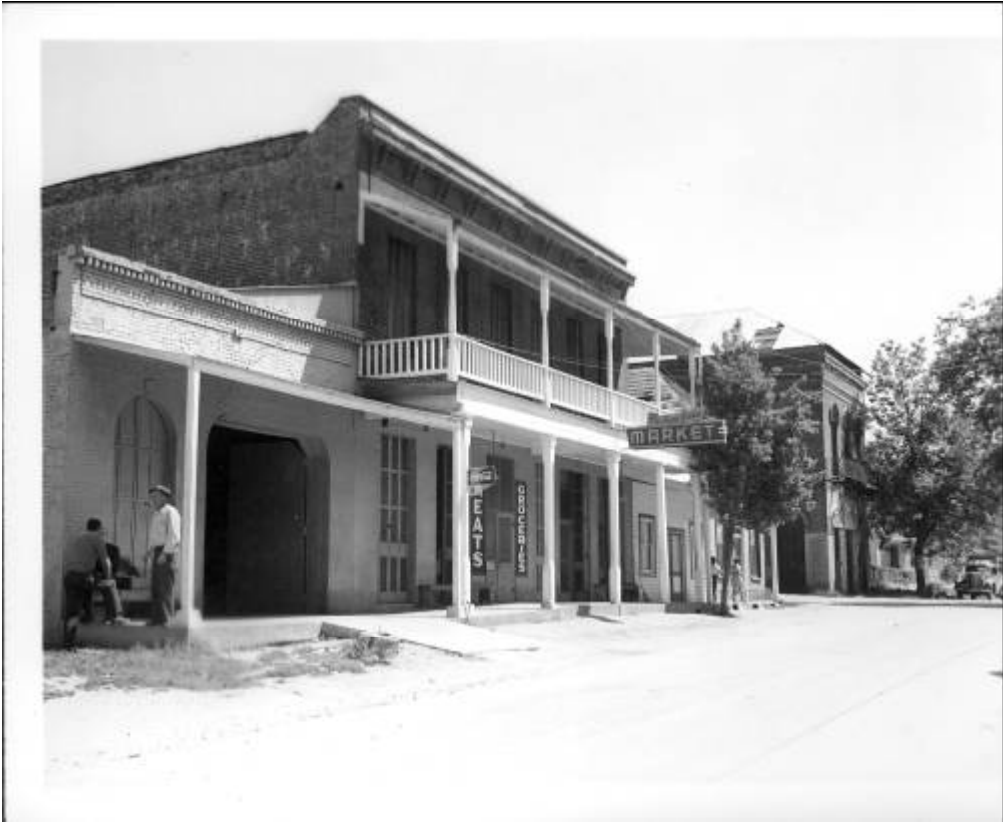
North San Juan, California 1949